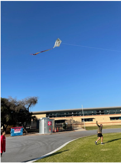
Test Fly at Rockingham Parish!